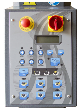
Intuitive Control Board