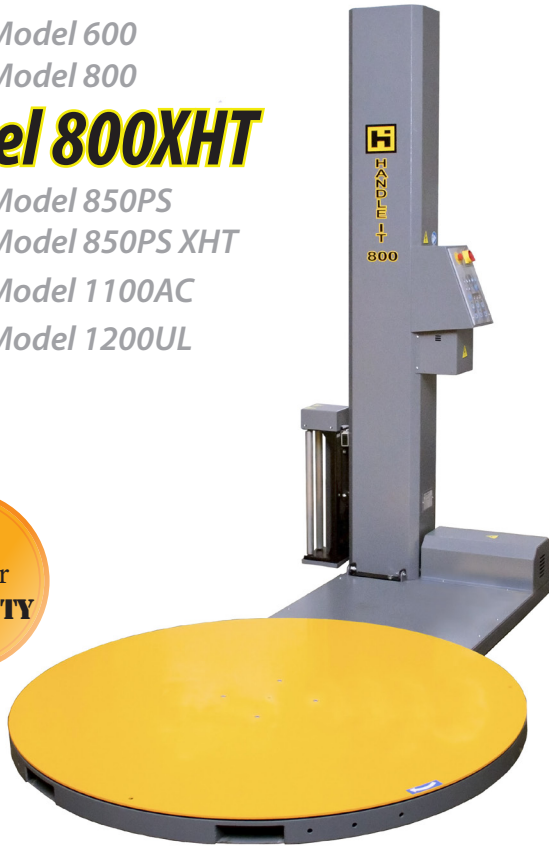
Part Number: SWM-SA-800XHT