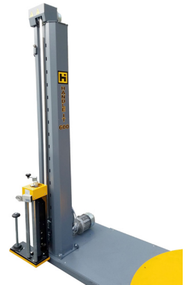
Powered carriage tower with photo eye