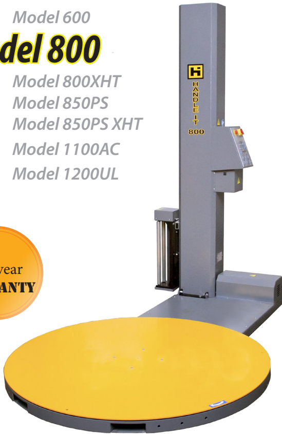
Part Number: SWM-SA-800