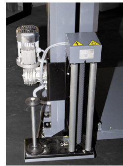
Electromagnetic film tension with easy film threading

Adjustable parameters by the control panel: cycle selection, bottom turns, top turns, rotation speed, carriage speed going up, carriage speed going down, film tension.