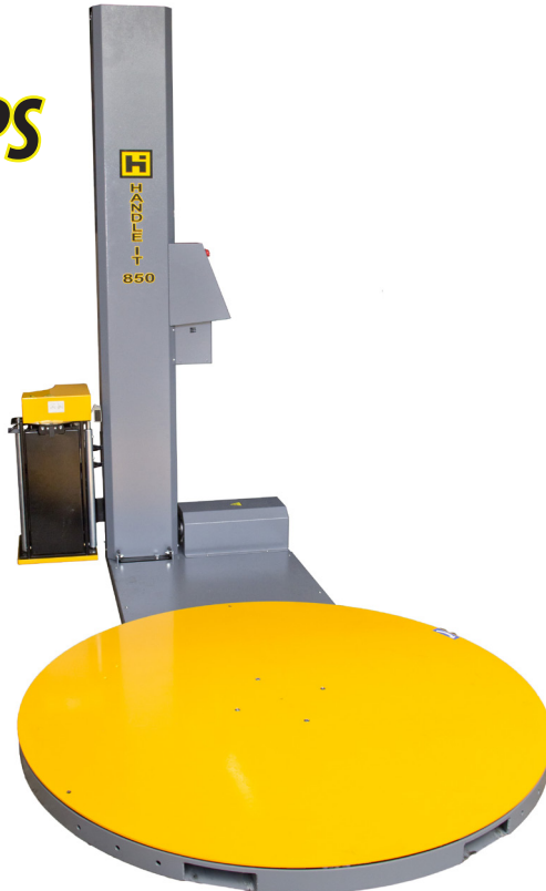
Part Number: SWM-SA-850PS