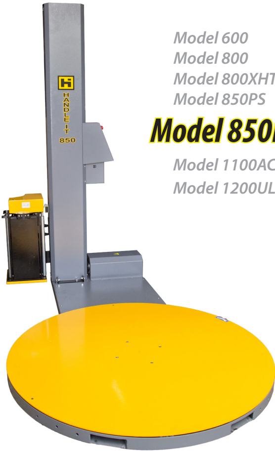
Part Number: SWM-SA-850PS XHT