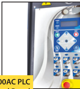
1100AC PLC Control Panel