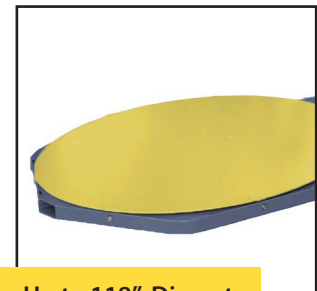
Up to 118" Diameter