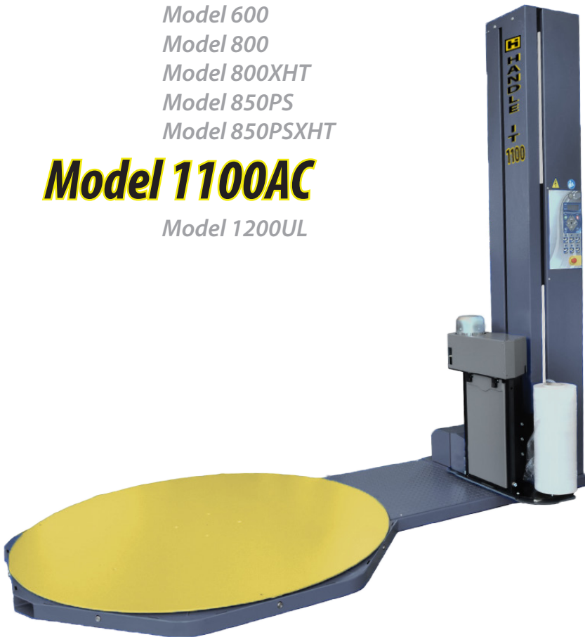
Part Number: SWM-SA-1100AC