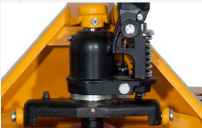
Hydraulic pump with over-load bypass valve