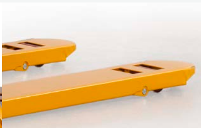
Durable powder coat paint finish