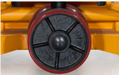
Polyurethane on steel core load and steer wheels