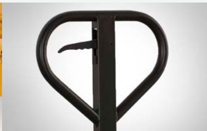
Teardrop handle with 3-way position lever for load control