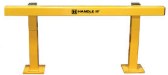
Single Rail with Extension