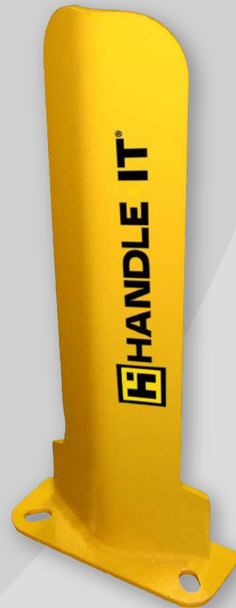
Shallow Profile Post Protector

Personal and professional customer service is offered on all Handle-It® Post Protectors. Our Post Protection carries a one-year limited warranty on all materials and workmanship.